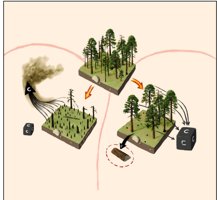
The carbon accounting consequences of two possible options for a given forest stand—untreated (left) and treated (right)—and the results following a wildfire event. The C-cubes represent the amount of carbon remaining in the ecosystem after wildfire. Originally published in Frontiers in Ecology and the Environment 6(9):493-498. See Hurteau et al. 2008.

Recent research in a ponderosa pine forest (Hurteau et al. in press) determined the differences in aboveground carbon storage between 1) the historic forest that experienced frequent, low-severity surface fires (reconstructed forest structure in 1876); 2) a forest where fires of all types have been excluded for more than a century and where no thinning has taken place (typical of today's frequent-fire forests in the western United States); and 3) a forest that has been treated using low, medium, and high levels of thinning of young trees to emulate the historical pattern, followed by one prescribed burn.